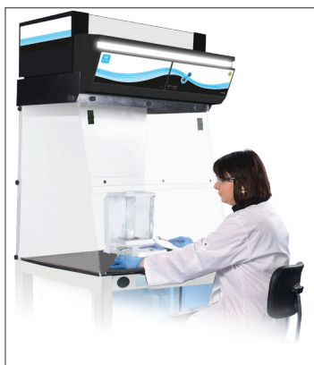
Captair Powder Weighing Station

Because Erlab's objective is to remain the world leader in preserving safety in the lab, we are constantly investing in our state-of-the-art laboratory and research teams. Our engineers and chemists are all seasoned experts in molecular filtration. The Erlab laboratory gives them access to sophisticated, analytical equipment to develop new