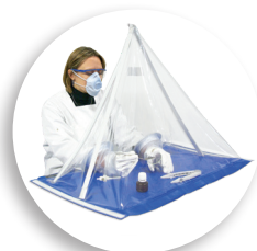
For laboratory investigations on a bench