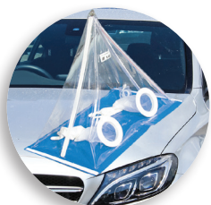
On a car