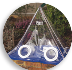
On a wall