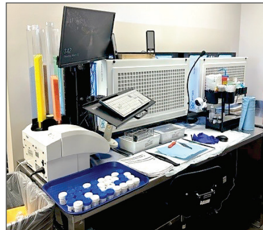
Unique table top application for HALO

Convergent Laboratories, likewise did their research and seriously considered a number of similar manufacturers who's offerings did not include unique vendor knowledge along with a high quality product that was environmentally friendly, at a lower operational cost than others on the market.