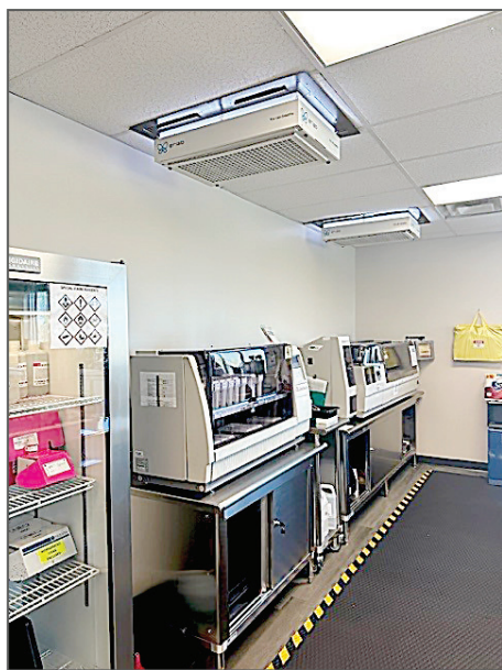
Traditional ceiling mounted use of HALO

In accordance with their stated commitment to personnel: