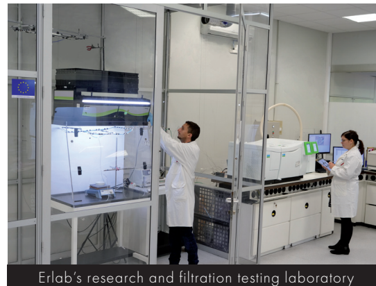
Erلاب's research and filtration testing laboratory