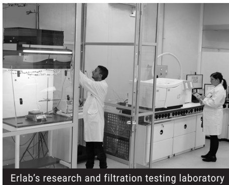
Erlab's research and filtration testing laboratory

The concentration of the chemical used for the test downstream of the filter must not exceed 50 % of the authorized Occupational Exposure Limit (OEL) or Threshold Limit Value (TLV). This phase must not be less than 1/12 of the duration of the normal operating phase.